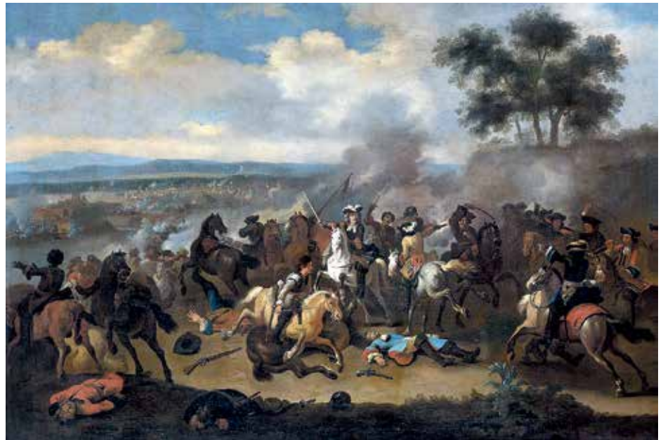
After Jan van Huchtenburg

There's a course in history, contrary to all this stuff about—you know, talking about calendar dates, or