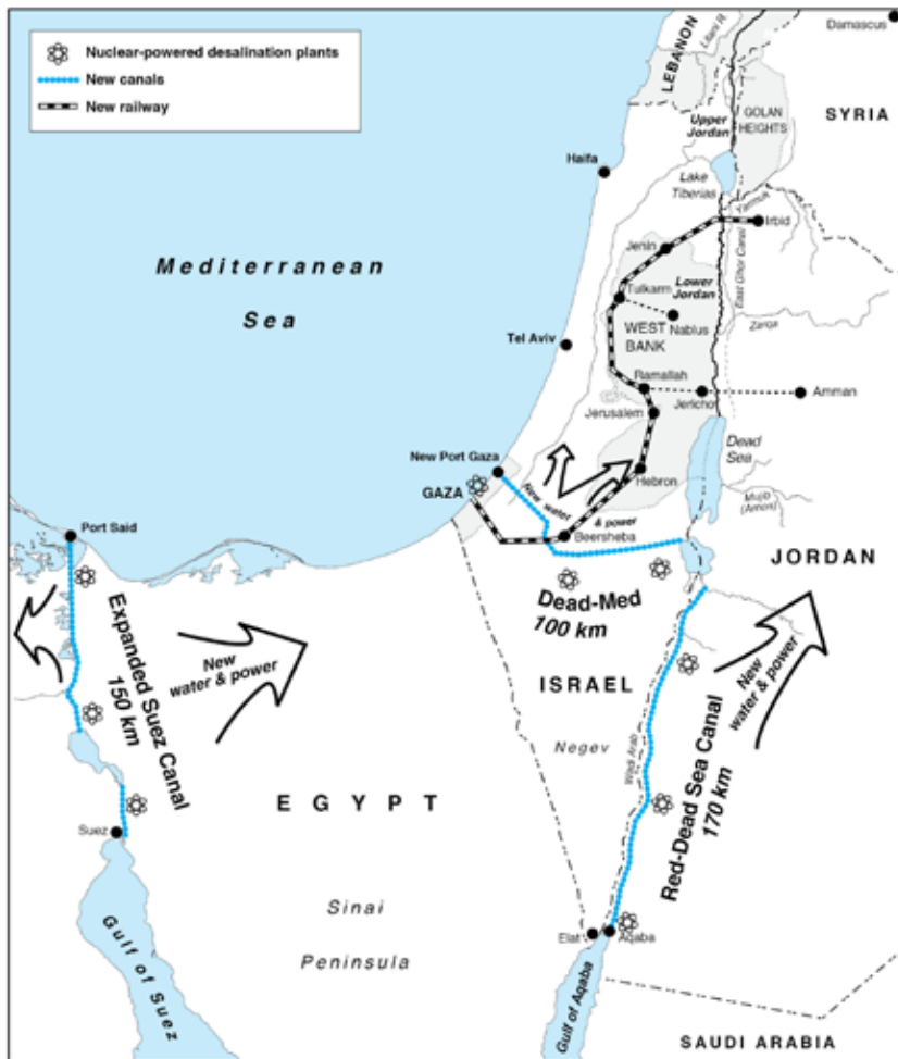
Presented by Lyndon LaRouche in 1975, the Oasis Plan provides a vision for all of Southwest Asia to be as developed as Germany used to be.