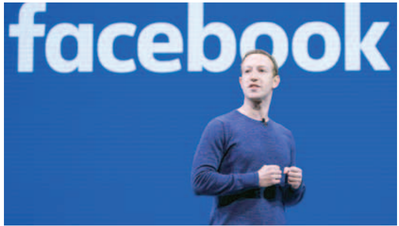
Mark Zuckerberg, founder, Chairman, and CEO of Facebook, Inc. laundered millions through P.I.E. Management and the Center for Technology and Civic Life.

Ballots filled out by individuals not registered to vote or lacking other critical information, if they existed at all, were counted by assigning a birthdate of 1/11/1900 to them, overriding the registration system, or by assigning the vote to a registered voter who had not voted. Military ballots, all marked exclusively for Biden, looked to be pristine and xeroxed and involved unregistered voters, a fact which was disregarded by overriding the registration logs by listing a birthdate of 1/1/20.