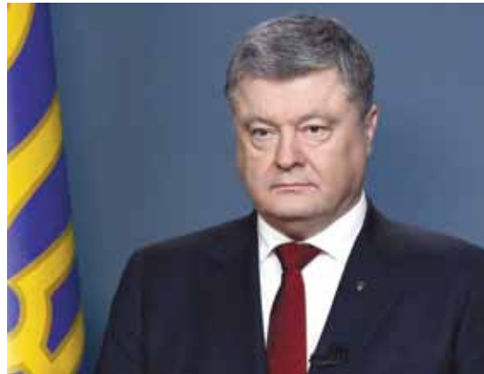
Presidential Administration of Ukraine

Thanks again to the excellent reporting of Max Blumenthal, we know that one of these groups, the Azov Battalion, has, in turn, trained neo-Nazis internationally, including the Christchurch, New Zealand shooter, the "Rise Above" white nationalists in Orange County, California, and participants in the Charlottesville, Virginia riot in the U.S. It is a token of Joe Biden's unbounded hubris that he opened his campaign with an attack on President Trump for causing Charlottesville, when the very same Azov Battalion had trained the neo-Nazi provocateurs who precipitated that event.