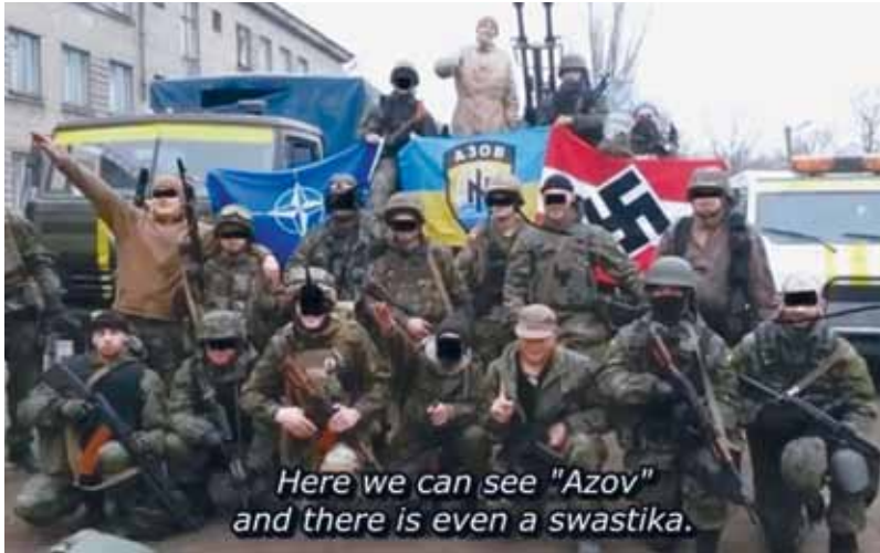
Members of the Neo-Nazi Azov Battalion, posing with swastika and NATO flags, received money from Ukrainian oligarch and Russia hater Ihor Kolomoisky, as well as training, weapons, money, and other support from British and the U.S. sources.

Seneca Partners, which had been staked with major dough from the Heinz family fortune, courtesy of John Kerry's wife, Teresa Heinz Kerry.