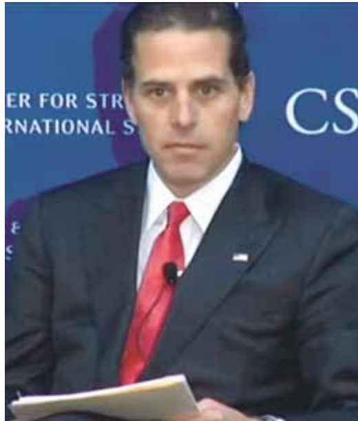
R. Hunter Biden, in 2013.