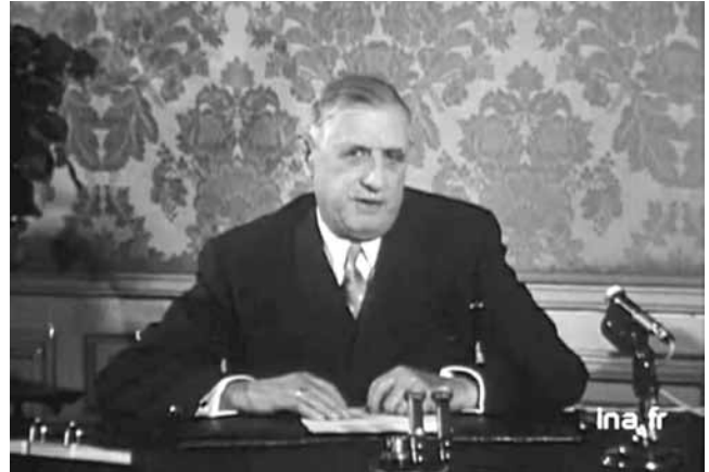
President of France, Charles de Gaulle, June 27, 1958.

True, we need in Europe a common policy of investments that will define our future, but not in order to confront any other country. On the contrary, we need a common policy to create the conditions of "understanding, coexistence and cooperation," as once defined by General de Gaulle, when he said in January 1964: "It is not excluded that China will become again, in the next