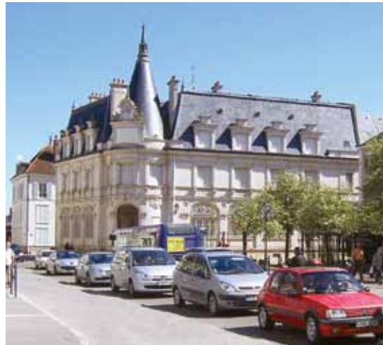
Montargis, France in 2003.

When we in Europe think about China, we should understand that Chang'an, our Xi'an, was the first city in the world with 2 million inhabitants under the Tang dynasty, and that Kaifeng [one of the Eight Ancient Capitals of China], under the Song, had more than a