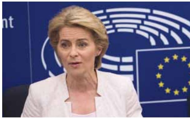
Ursula von der Leyen, newly-elected President of the European Commission.

However, how this is to jibe with the defense of the “European lifestyle” demanded by von der Leyen is a mystery. In addition, if you look at the package of climate taxes and regulations, which was announced by Germany’s “Climate Cabinet” of Environment Minister Svenja Schulze, it should be clear to everyone that nothing of our current lifestyle will be left. The prices for energy and transport and, as a result, for everything else, will be driven up so high that the less privileged will use bicycles instead of cars and airplanes, and will wear thicker pullovers in winter instead of turning on the heat.