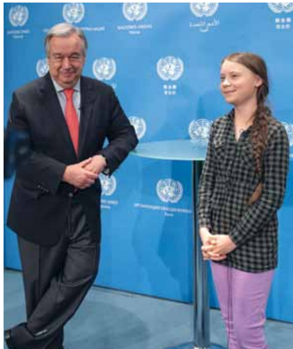
UN Secretary General Antonio Guterres promotes climate activist Greta Thunberg in Vienna in May 2019.