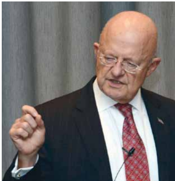
Former Director of National Intelligence James Clapper.

But you never know; they don’t give you any specifics so you can sort out—what I was doing, was looking for something that would help me validate what they were saying; and I couldn’t find anything in it. In fact, I found these contradictions. And oh, by the way, on page 50 [of the report], they say “This Office did not examine serv-