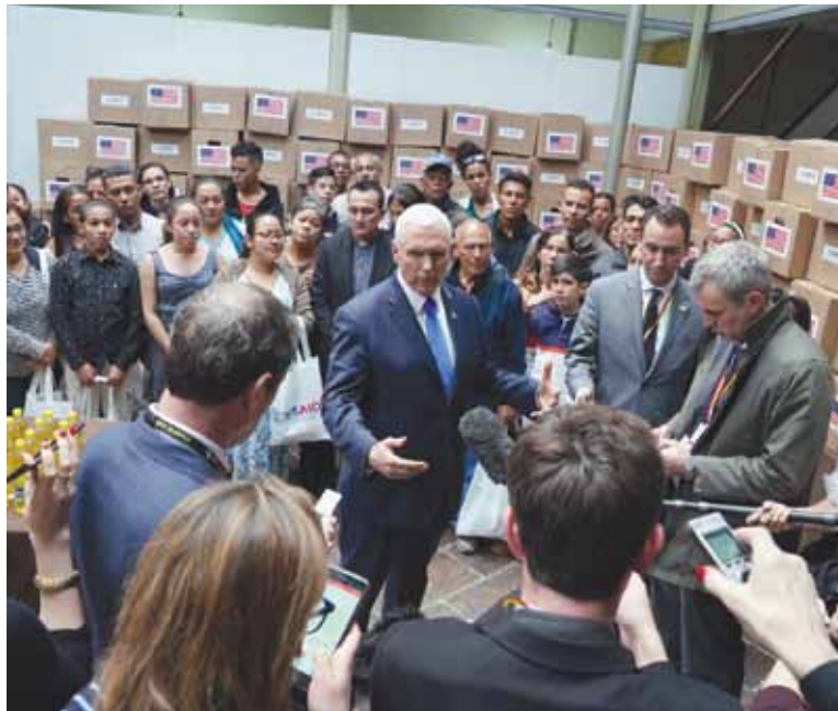
Vice-President Mike Pence speaking with reporters while meeting with Venezuelan migrants in Bogota, Colombia on February 25, 2019.

There are still military exchanges going on, so I think it is very important that there again, as we have seen it in the case of North Korea, you had Putin, who telephoned Modi; you had the Chinese government and also Trump all offering their mediation and offering to help to cool the situation down. These two instances—North Korea and now the India-Pakistan situation—