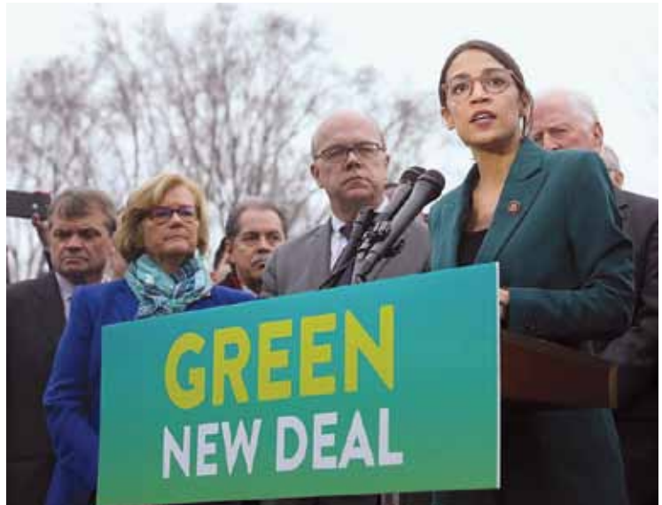
Rep. Alexandria Ocasio-Cortez promoting her Green New Deal program in front of the Capitol Building in Washington, D.C. on February 7, 2019.