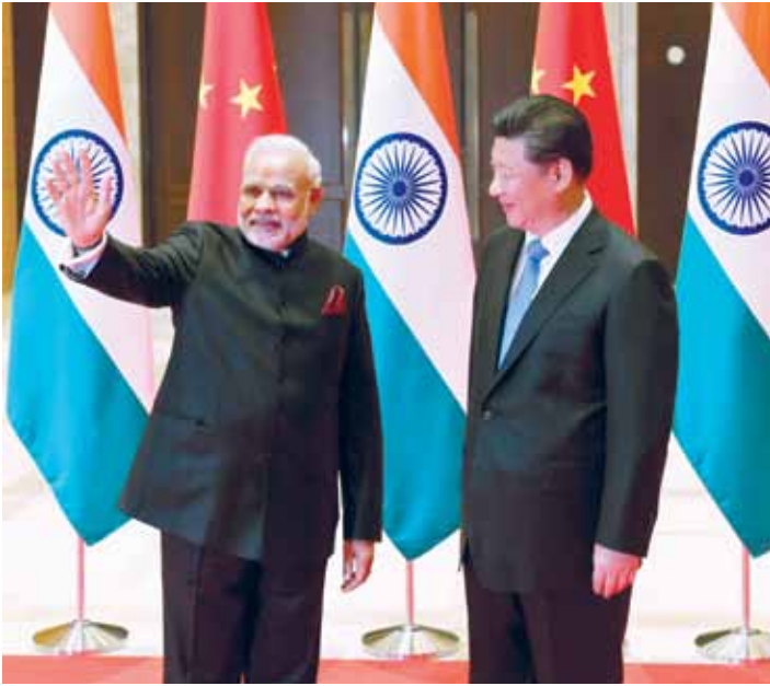
Press Information Bureau of India