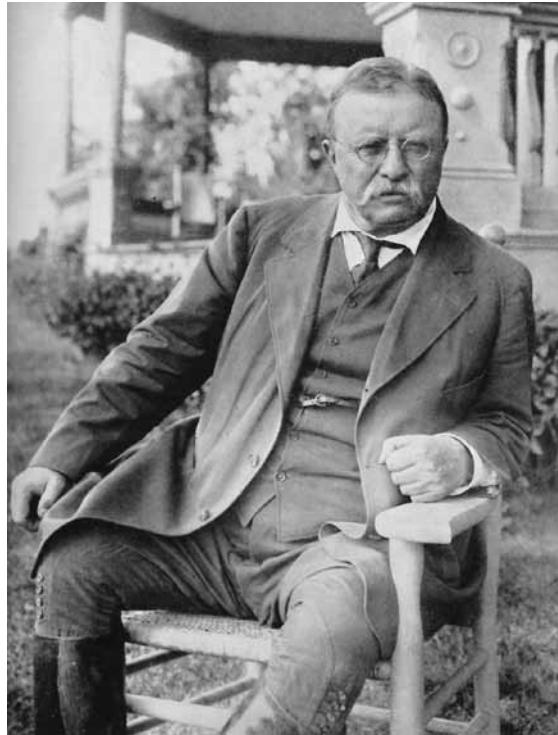
President Theodore Roosevelt's elevation to the Presidency in 1901 coincided with the downslide of American morals and culture.