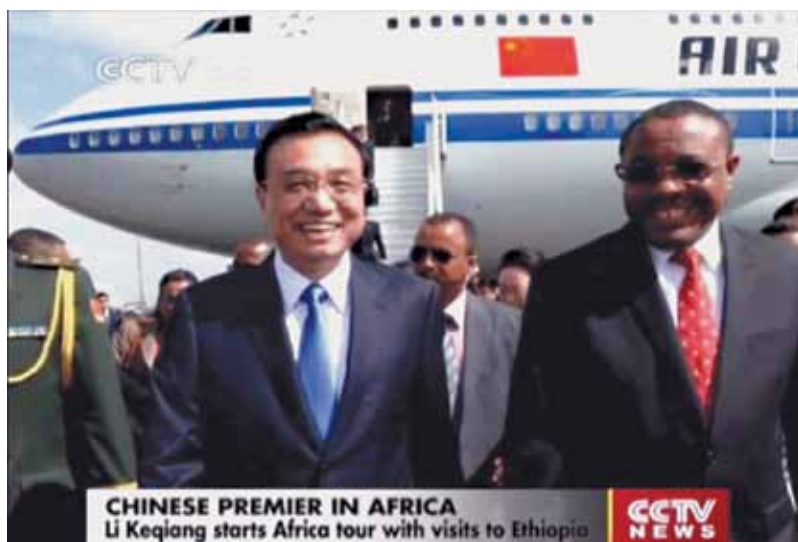
Ethiopia was the first stop on Foreign Minister Li's trip to Africa, where he was greeted at the airport in Addis Abeba by Prime Minister Heilemariam Desalegn.

No American leader has moved in this policy direction since John F. Kennedy was cut down. The policy