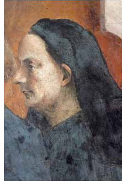
Brunelleschi's invention of linear perspective made possible the portrayal of a three-dimensional universe on a two-dimensional surface; he then superceded that discovery, with his development of a general theory of curvature. Shown (above left), Brunelleschi's perspective design for the interior of Santo Spirito church (Florence, 1440s), and a photo of the church interior, below. Brunelleschi's portrait (detail) by Masaccio (1420s).