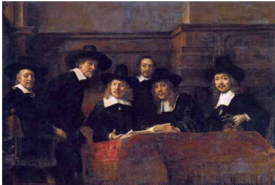
The “dominant system of empire throughout the planet today, was originally consolidated as the Seventeenth-Century Dutch imperial system,” known today as the British Empire. Shown: Rembrandt’s “The Syndics of the Drapers Guild” (1662) depicts Amsterdam’s merchants of the Dutch East India Company.

The core of the foolishness of the governments of such leading nations as the current Anglo-Dutch Empire-system (which controls under its own dominion, much of the nations of the world) is that it is a modern expression of the same oligarchical principle of all the greatest of the known empires of the planet. The behavior of such imperial oligarchical systems has conformed to the same most essential features of their characteristics for as far back as we possess systemically accurate knowledge of such imperialist entities. The fact of the matter presently, is that the dominant system of empire