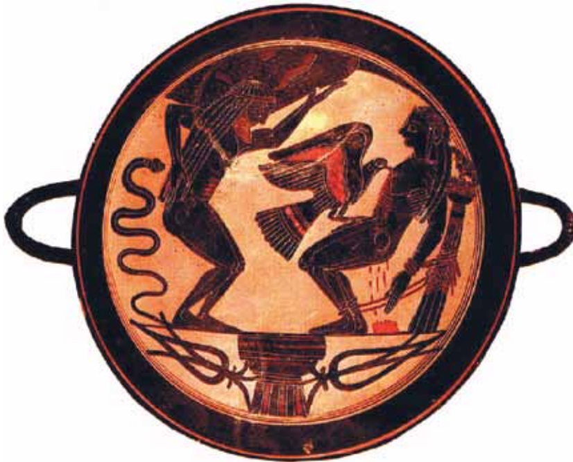
Prometheus committed the sin of loving mankind, giving him fire (science), from which man would learn many arts, and hope (for the future), for which he was to be tortured by Zeus for eternity, as depicted in this ca. 555 B.C. painting on a Laconian kylix (drinking cup).

who does not rely upon a mankind-controlled development willingly. 3 Those two contrasted types, bestial versus truly human, may merely appear to represent parallel cases, as with an implied heredity in respect to a relatively unique affinity to either Cain ( Zeus ), or Abel ( Prometheus ), respectively. When the latter pair of figures from presumed mythological origins, are examined for the distinctions of the violent beast from the uniquely fire-using human, the consequence of those compared usages is the distinction of the differences of the characteristics of mankind from the (oligarchically) systemically cruel beast.