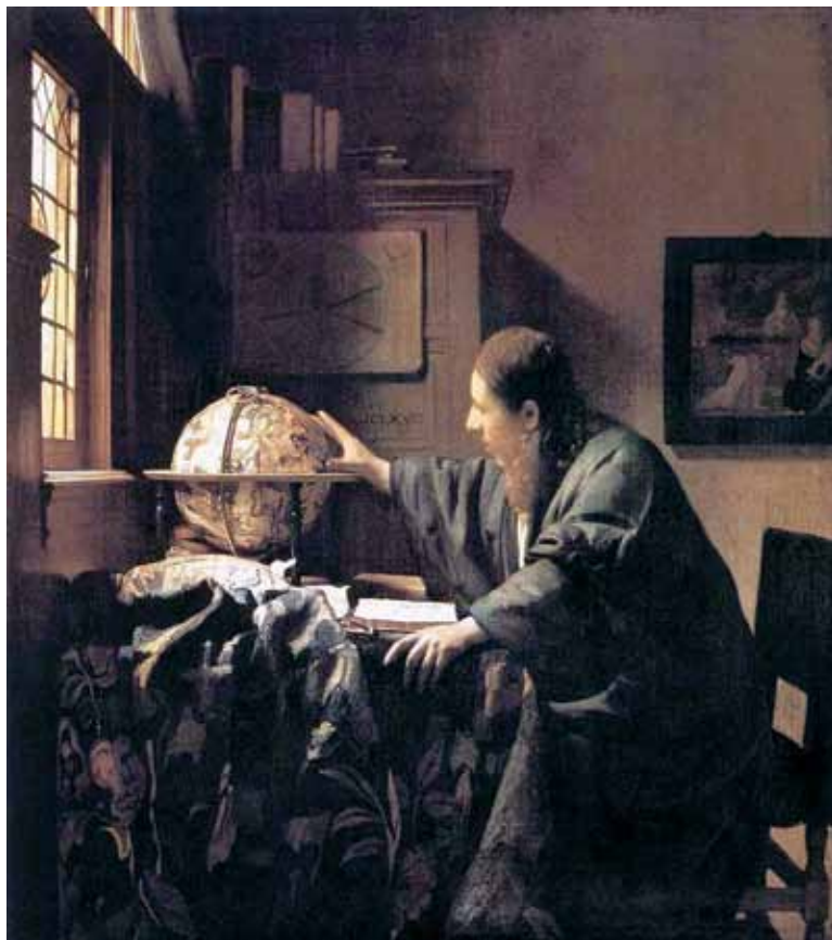
Despite the achievements of the Renaissance and later scientific advances, such as those in astronomy, “the evidence is, that the obscene cult of sense-certainty, has largely still persisted.” Shown: Johannes Vermeer, “The Astronomer” (ca. 1668).

Such misguided presumptions as those, typify the particular cult-doctrine which demands popular faith in even mere sense-perception as such, which it is demanded must be accepted as even a virtually physical standard of academic fustian, and, also, actually, that of an attempted replacement for an entirely different metric: an honestly, practically principled test of truth-