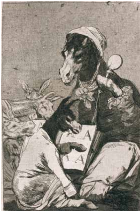
The folly of most modern education, writes LaRouche, is "a commonly misguided standard for the practice of an 'education' rooted in what are actually pathetic presumptions respecting the nature of the human mind." Shown: Goya, Capricho 37, "Might not the pupil know more?" (1797-98).

The evil which that aforesaid moment of history rep-