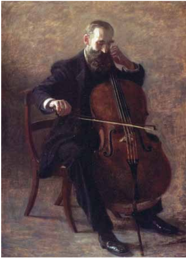
Classical works of art are those rooted in “the noëtic functions’ of the human mind.” Shown: Thomas Eakins, “The Cello Player” (1896).

These include specifically human sense-perception; which include (1) sense-perception as such, and the other, (2) the double meaning used to reference an existent principle of a state of life. The source of the often mistaken explanations associated with those two, just stated categories, presents doubts arising from any attempt to classify what those categories are commonly presumed to signify, as a matter of the notion of the precise identity and an existent efficiency of the physically-efficient definition of “life.” That means the actual life of a human species, or that of the active life of the still-living, human individual. A very strong hint respecting the meaning of such subject-matters and their distinctions can be established. However, some groundwork is required respecting what all of this might actually be intended to mean in the practice of society. There is quite a lot to be sorted out on this account.