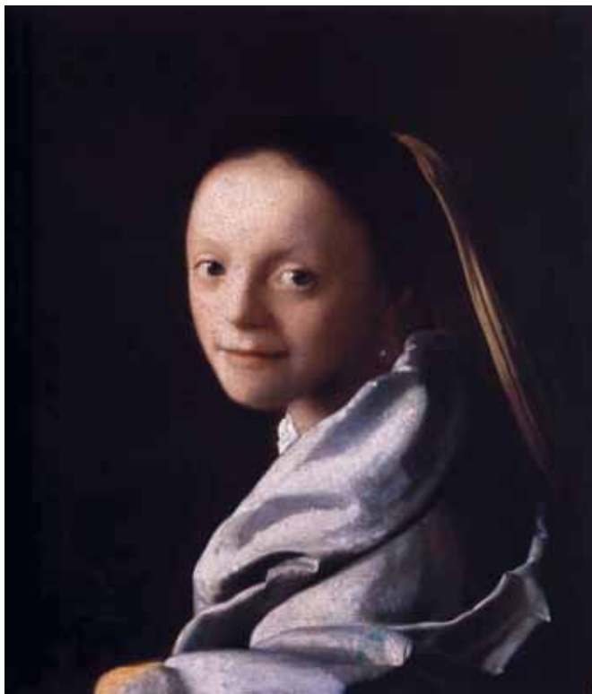
The creative spark in every human individual is what differentiated him or her from the beasts; it is this on which the progress of mankind depends. Shown is Johannes Vermeer's "Portrait of a Young Woman" (1665-67).

The emphasis is to be placed on discoveries which, in one sense, or degree, had not been presented to human authors of original creative performances, ear-