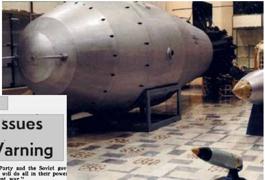
Russian Atomic Museum

Soviet Premier Khrushchov commissioned the super-bomb known as “Big Ivan” (“Tsar Bomba” in the West) the largest nuclear weapon ever built and detonated. The UPI article is dated Aug. 8, 1961; the bomb was detonated on Sept. 1.