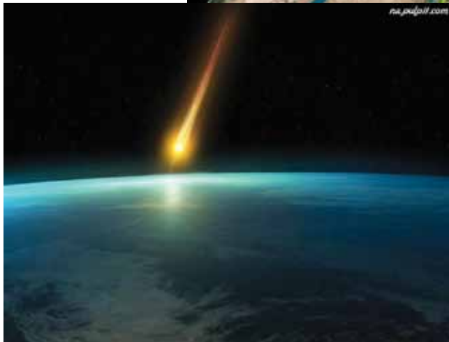
Russian Ministry of Defense

Saudis, with the BAE, particularly, if you understand what the BAE is, and that the BAE is actually the author of 9/11, because it's a part of the Saudi operations which ran 9/11, and are running it now.