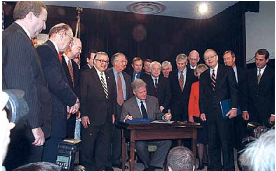
The dumbest thing Bill Clinton ever did, was to repeal the Glass-Steagall Act. Its revocation "has been the basis for the ruin of the United States," LaRouche said. Here, President Clinton signs the death warrant for the Act in 1999.

So, the situation is that if you have a political process which is free of the party system corruption, and looking at reality, this couldn't happen. Because, think what would happen. You have General Dempsey and his crew, the Joint Chiefs of Staff, and they reflect not only the Joint Chiefs of Staff, they reflect the most talented, most thinking, shall we say, of the U.S. military command. Do you think, that if their voices were heard, by the Senators and the members of Congress, as foremost, do you think they would take the risk they're taking