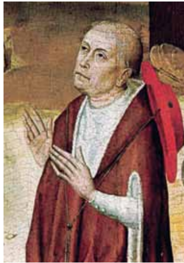
Cardinal Nicolas of Cusa (1401-64), in response to New Venetian Party's takeover of Europe, set into motion a cultural "earthquake" with Columbus's trans-Atlantic missions establishing the roots of a new-born culture within the Americas. Left, Columbus; right, Cusa.

the evolving policy which motivated the virtual cultural "earthquake" which had been set into motion by Christopher Columbus' trans-Atlantic missions for establishing the roots of a new-born culture within the Americas.