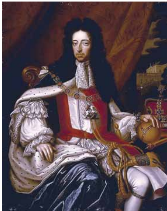
England's King William III (Prince of Orange) embodied the New Venetian system of oligarchism, and his successors in the House of Windsor today have continued that mass-murderous tradition.

The most notable peculiarity of that virtually world-empire form of European cultures, has passed, chiefly, through, four, successively, intrinsically doomed, distinct qualities of form of content: (1.) The original Roman Empire; (2.) Byzantium; (3.) The so-called Crusader system; and, (4.) The “New Venetian empire,” spawned by the followers of Paolo Sarpi, and the spawn