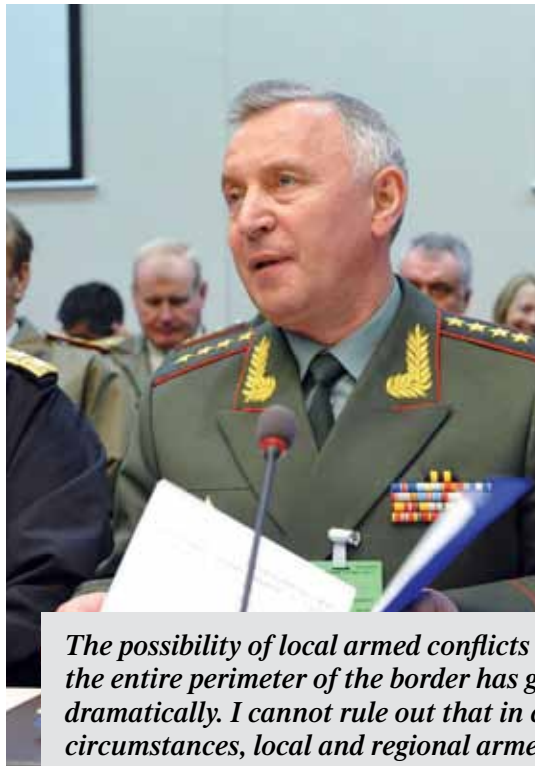
Russian military leaders are fully aware of the danger of thermonuclear war, and are saying so with increasing frequency. Chief of Staff Gen. Nikolai Makarov was especially explicit in his November 2011 address to the Russian Public Chamber.

My own first relevant political action after my World War II military service, was a very brief 1947 letter to General Dwight D. Eisenhower, then in authority at Columbia University, in which I had urged him to seek election to the Democratic Party’s nomination for the U.S. Presidency against the depraved incumbent, and Churchill and Wall Street flunky, Harry S Truman. My specific, stated intent was to requicken what had become, under President Franklin Roosevelt, the cause of the victory in World War II, of all among those citizens who had served, to bestir the conscience of the nation to return to those intended,