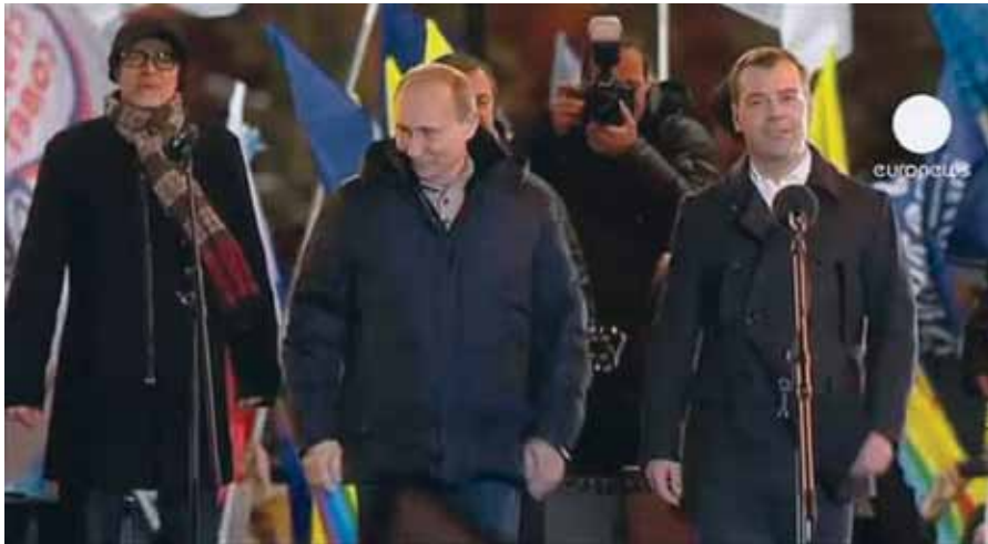
Incoming Russian President Vladimir Putin and incoming Prime Minister Dmitri Medvedev on March 5, at a huge rally in Moscow celebrating their victory in the previous day's election. The British-controlled enemies of Russia are furious that their effort to smash Putin has failed.

Western Europe and Eastern Europe have suffered since that time, would have occurred as they did. My intended science-driver operation would have become the rich destiny of a shared science-driver orientation which would have defeated our republic's truly principal, British adversary since the likes of the British "Wall Street" agents Aaron Burr, Martin Van Buren, and their treasonously inclined, corrupt fool Andrew Jackson. Such have been merely typical among the elements of that British imperial program which has destroyed the peace and economy of the world among leading groups of nations then, as still today.