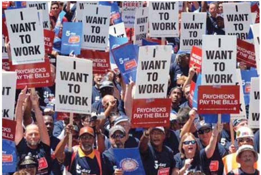
Millions of people who are unemployed, including skilled workers, could be put back to work building the great NAWAPA project for revolutionizing the water system.

The second thing is, because of the degree of bank-