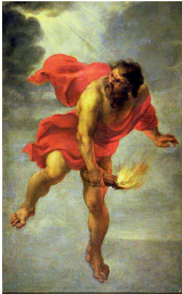
Left: Aeschylus’s Prometheus provides the touchstone for the principle of tragedy, specifically, the fact that societies fail due to a systemic defect in their culture. That defect reduces man to something less than human, a state enforced, as in Aeschylus’ play, by would-be gods of Olympus, who would deny man the knowledge (fire) he needs to live a human life. Here, Jan Cossiers, a 17th century Flemish painter, depicts Prometheus bringing fire to man.

Poetry imagines the future; science is thereby moved to create it, willfully, on a demonstrable basis.