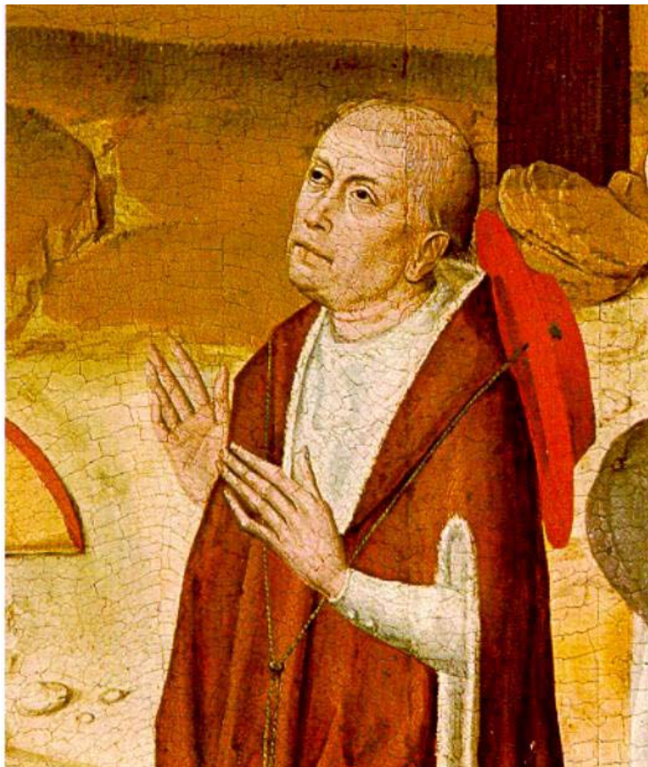
The modern scientific outlook, which, like Classical tragedy, proceeds from the Platonic conception of the relationship between the human mind and the universe, derives from the discoveries made by Cardinal Nicholas of Cusa, the 15th-century philosopher and cleric depicted here.

I have, heretofore, repeatedly used the example of the hypothetical case of the pilot of a space-ship flying from Earth-orbit, to Mars-obit, for the case in which that pilot relies on instruments which serve as surrogates for human sense-perceptions. I have compared this behavior to those such as scientist Albert Einstein's treatment of the implications of Johannes Kepler's uniquely original discovery of gravitation, as Kepler presents his proof in detail in his The Harmonies of the Worlds . So, by the same method which I have emphasized here, Einstein defines the universe as being finite, but, without a confinement which suggests the existence of more or less fixed outer bounds, as both the errant Aristotle and Paolo Sarpi do. In other words, ours is a universe which is actually defined ontologically by limitless potential for creative change in and of the universe itself. With man, that