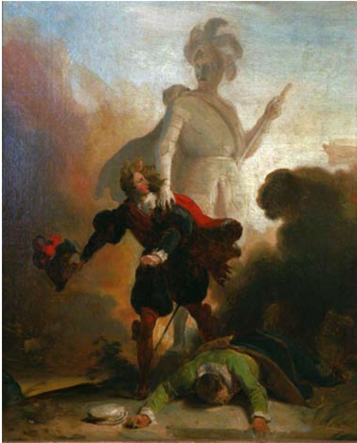
Wolfgang Amadeus Mozart's tragic opera Don Giovanni , is an attack on the systemic evil of not only the satanic Don Giovanni, but the entire Habsburg culture of the period. Here, 19th-century French painter Alexandre Fragonard depicts Don Giovanni being dragged to Hell by his stone guest.

nation which carry us up and away from the experience of belief in sense-certainties, into the domain in which the creative initiatives of the mind itself may dwell. Truth lies in that which should have been done, had that culture's morality not been critically flawed, flawed as in the case of the stubborn supporters of failed Presidents such as George W. Bush, Jr., and Barack Obama, and in the case of the morally failed majority which selected and defended such mis-choices of Presidents. Truth, rather than what a prevailing opinion represents, must be preferred. The experience of perception by the audience must not blur the truth which is the proper intent of the drama's performance.