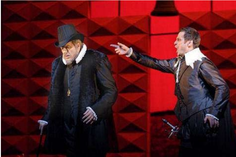
The conspiracy between King Philip II of Spain, and the Marquis de Posa, in relation to the King's son and Posa's friend Don Carlo, plays a crucial role in bringing about that tragedy. Philip and the Marquis are shown here in a scene from Verdi's opera Don Carlo . The principle that Friedrich Schiller, who wrote the play from which Verdi composed, used, was a principle comparable to that of Johannes Kepler's, juxtaposing two different senses.

di's setting of the pair, as conspiring behind the back of Carlos; and, consider, conversely, a judgment of that pair which may follow from the ultimately assigned sense of the reality of the effect of the pair's judgment on the third, such as that Carlos.