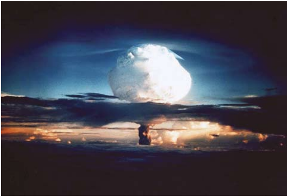
We need the nation-state as an institution, but we cannot solve our problems by warfare any longer: Nuclear warfare is unthinkable. Shown: an H-bomb explosion, Operation Ivy, 1952.