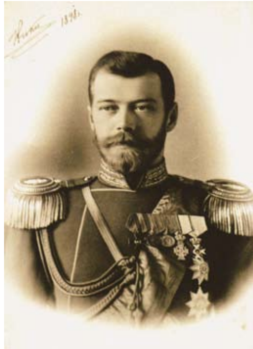
Russia's Tsar Nicholas II (r. 1894-1917) was a victim of the British imperial machinations, leading up to World War I. He "was caught in the crossfire" of the Bolshevik Revolution.

LaRouche: But it has to be made. And the point is, it's either going to come as chaos, which can last for a generation or two, or it can come by decision of a few governments that use their heads.