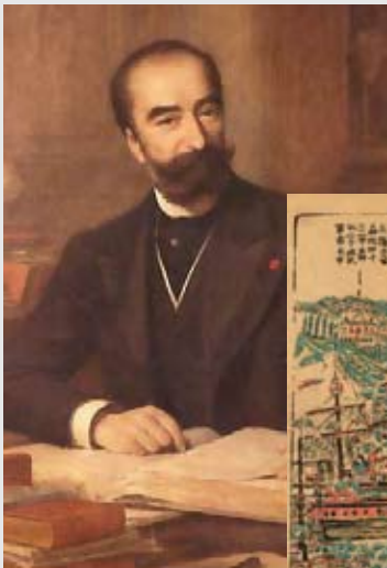
Marie François Sadi Carnot