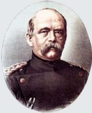
Count Otto von Bismarck

The orchestration, by the British Empire, of two world wars in the 20th Century, "could not have happened as it did," LaRouche writes, "but for the four crucial strategic factors: