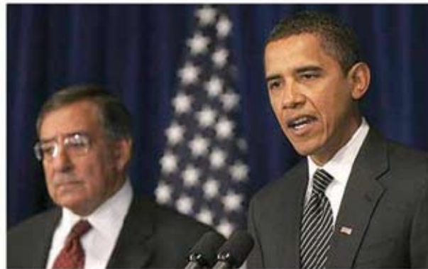
The CIA has told President Barack Obama that British terrorists are the biggest threat to the US American spy chiefs have told the President that the CIA has launched a vast spying operation in the UK to prevent a repeat of the 9/11 attacks being launched from Britain.