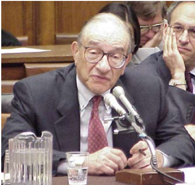
House Financial Services website

By signing the bill revoking the FDR-era Glass-Steagall Act in 1999, President Bill Clinton opened the gates of Hell. Alan Greenspan, “one of the biggest criminals” against the United States, was running the Fed at the time.