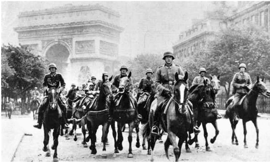
The British had been for Hitler until the German Wehrmacht succeeded in taking over France. "They were very happy to have Hitler going against the Soviet Union and other states in Eastern Europe. They were never upset about the killing of the Jews by Hitler—not at all!" Here, Nazi troops march into Paris, June 1940.

standpoint of being an historian and an FDR scholar, I find this to be absolutely offensive. However, I do think that it is important to take the question up, since it is now being spread about so widely. Could you please comment on your own assessment of President Roosevelt's pre-war policy, and also what it is that motivates these people to launch this kind of attack?"