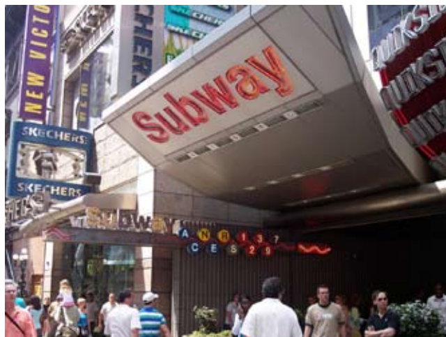
Without mass transit, the American people are spending their lives commuting in their cars; it's destroying families, and the culture generally. And mass transit is cheaper: "If you ran the New York subway system fare-free, you would save money." Here, a subway station in New York's Times Square.

What you need is—how about building a high-speed transit system for the nation? It was torn up. How about building power stations that are needed? How about building a hospital system, which is needed? You can't get the care you used to be able to get in the system because you don't have general hospitals and so forth, one-stop service for all people. So, we should be building our river systems; we should be building our trans-