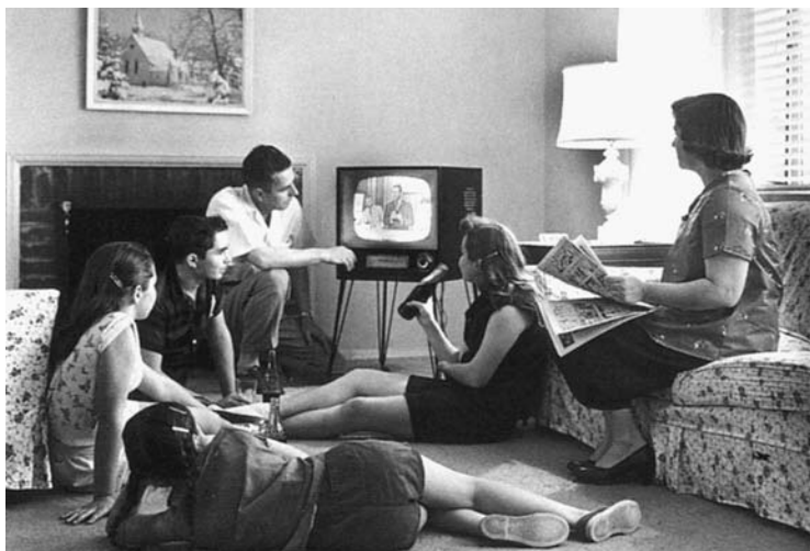
At the time of LaRouche's first public forecast, of the 1957 Recession, Americans were lulled into a false sense of security by the one-eyed monster that began appearing in every household.

My June-July 1987 forecast of a highly probable