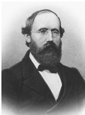
Since LaRouche adopted Bernhard Riemann's method, no forecast of his has failed.

...The fact is, that, since the time, during 1953, I settled upon Bernhard Riemann's method of physical geometry, no economic forecast I have ever delivered, has failed; and, only by exception has that forecast assumed the form of what might have appeared, mistakenly, by some, to have been what is usually regarded as merely a prediction.