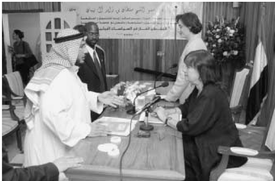
Helga Zepp-LaRouche, and a conference participant at the Zayed Centre, discuss the analysis of the economic and strategic crisis reported in EIR.

LaRouche: There would be no rational reason for the United States to consider doing that. That doesn't mean it wouldn't happen. We have, in Washington, many things that have happened recently, which no sane President would wish to do. We have an out-of-control situation. Remember, . . . this has to be taken into account. The United