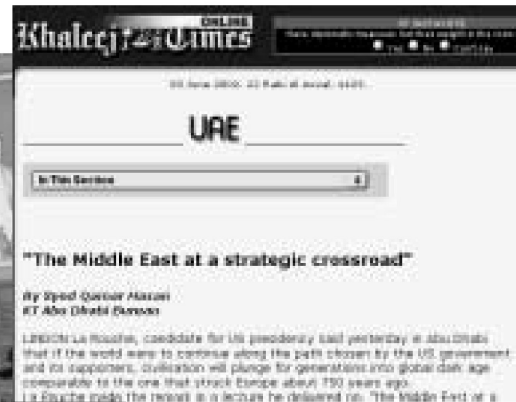
Lyndon LaRouche speaking June 1 to the Zayed Centre for Coordination and Follow-Up in Abu Dhabi, at the opening of the Centre's two-day conference. On LaRouche's right is U.A.E. Oil Minister Obeid Bin Saif Al-Nasser, and on his left, former Iraqi Oil Minister Essam Abdul-Aziz Al-Galabi. Inset: an Abu Dhabi newspaper reports LaRouche's view on its website.

case, we shall see the implicit strategic potential of the Middle East as the crossroads of Eurasia. Any long-range forecast of the prospects of Middle East petroleum must be studied in the context of that challenge.