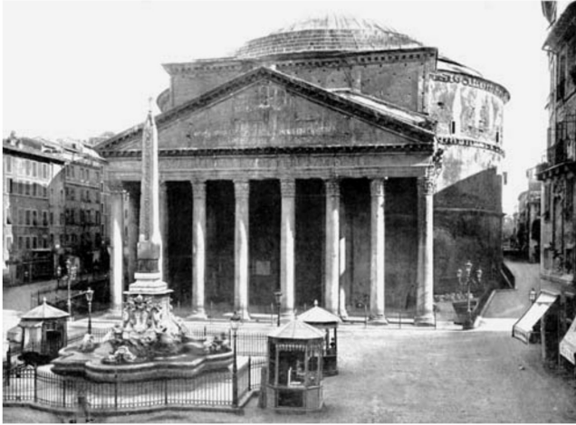
The Pantheon in Rome. "All empires were based on the principle of the Pantheon. And the way that the emperor ruled the empire, was to play the different religions of the Pantheon against each other. What Brzezinski is proposing, is exactly that: a war among cultures, to define the planet as a Pantheon, and to make war among the different religions and cultures of the Pantheon. That is the Islamic 'Clash of Civilizations' thesis of Zbigniew Brzezinski."

I read a radio interview you gave a few hours after the attack on the Twin Towers, in which you spoke about the risk of a depression on a global scale as a consequence of this attack. Is there not a bit of pessimism on your part, regarding the situation which has been created? You spoke of a global crash, or a global collapse, when all of the major international financial analysts, starting with Morgan Stanley, have spoken of a recession which can be overcome in six or nine months.