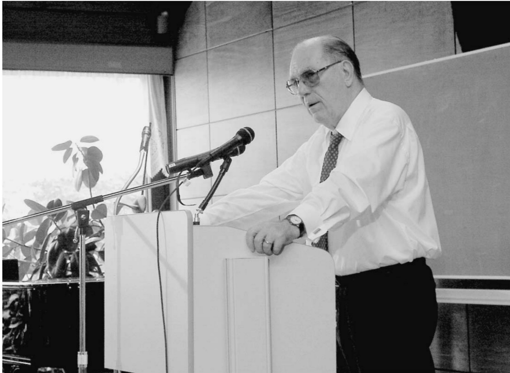
Lyndon H. LaRouche, Jr. at a conference in Germany, August 2001.

like world war. We've had, despite the newspaper reports, an attempted coup d'état in the United States, against the Bush Administration. And, unfortunately, that is the thing we must first consider, because otherwise we would completely misunderstand the world situation in all its aspects.