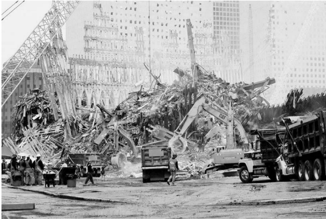
The scene at the World Trade Center on Sept. 13. "You may start a fire in a theater," LaRouche said, "and the people will panic in response to the fire, and then you'll be able to do certain things, in consequence of a few people having panicked many. That's a simple explanation of the way a coup d'état works."

the financial, monetary crisis, which is what I propose, and others have proposed, as a New Bretton Woods approach. Or the idea of the Eurasian Land-Bridge is a very specific way of creating an economic policy, which supports the idea of a New Bretton Woods. It's obvious, it's very obviously needed. Europe, Western Europe, can not survive economically under present conditions. Unless Europe can again export, open up its exports, for technology products, especially into Asia, it can not survive.