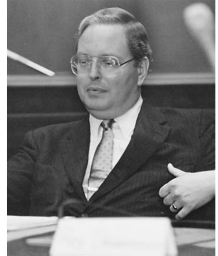
Televangelists Jerry Falwell and Pat Robertson, and Christendom College founder Paul Weyrich. The religious right gathering of gnostic “political theocracy,” is the Bush league’s fascist mass-base for launching a “universal fascist” world order.

lege’s gnostic orbit. On all of the fundamental issues of statecraft, law, and of theology, too, no competent judgment can be presented, until it has been developed from that Classical standpoint in natural law from which the U.S. 1776 Declaration and Independence and 1789 Preamble of the Federal Constitution were derived. Therefore, all competent definitions of phenomena such as gnosticism in general, or the gnostic theology of Christendom College’s practice, must be rigorously grounded from that very same standpoint in natural law which Scalia has rejected as abhorrent to him.