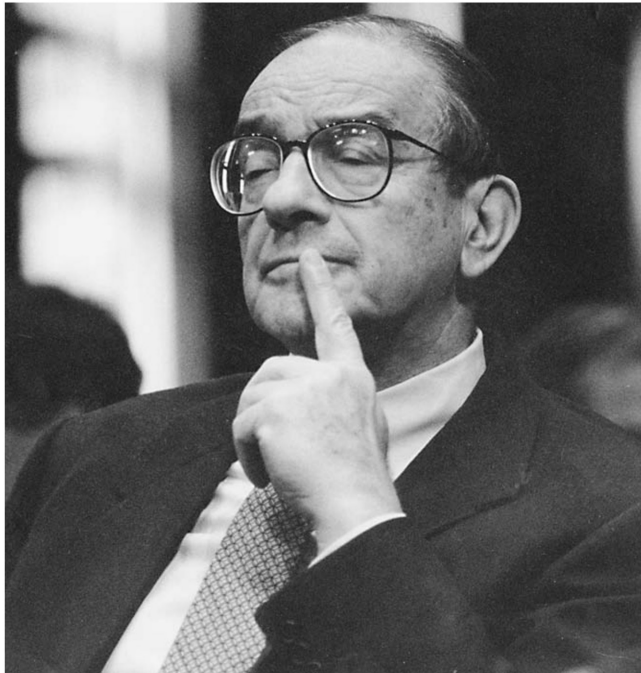
Step 5: Federal Reserve Chairman Alan Greenspan perpetrates the fraud known as “Y2K,” pumping vast amounts of money into the financial system, in a desperate effort to maintain the speculative bubble.