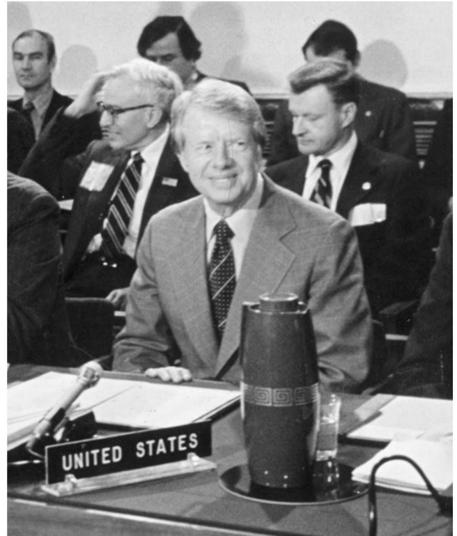
Step 2: Zbigniew Brzezinski's choice for President, Jimmy Carter, wreaks havoc with the U.S. economy. Here, Carter with members of his Cabinet, including Brzezinski (behind Carter, to his left).

of that, combined with Kissinger's orchestration of such developments as the 1973 Middle East war, unleashed a terrible ruin within the U.S. economy.