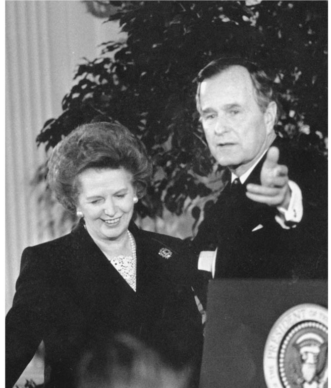
Step 4: Margaret Thatcher and George Bush, along with France's François Mitterrand, set into motion the policy known as "globalization," to destroy the world's nation-states.

the advent of January 1, 2000, would cause a chain-reaction financial collapse.