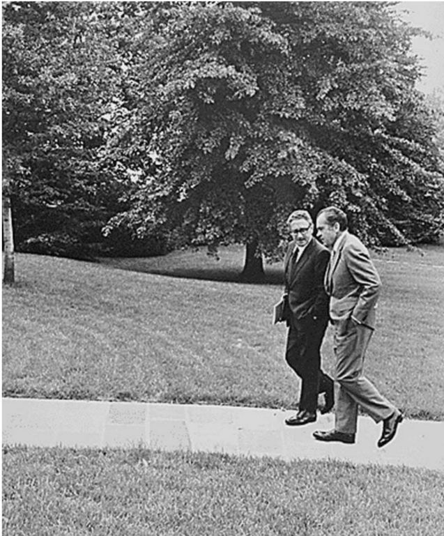
The first step into Hell: President Nixon's shift toward the "Southern Strategy," which led to the collapse of the Bretton Woods agreements in August 1971. Here: Henry Kissinger with the President, 1971.