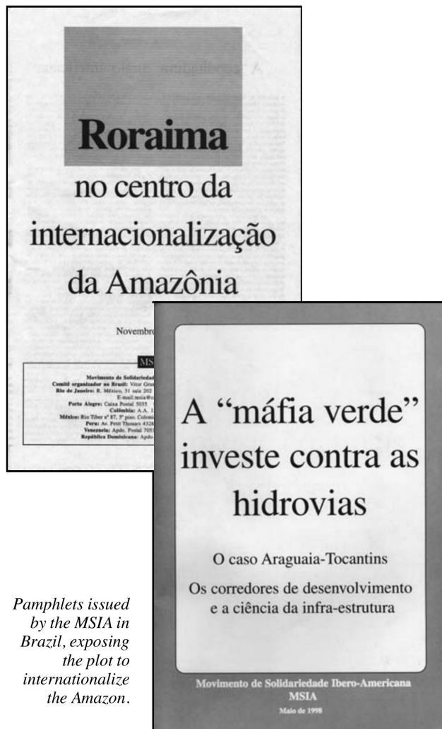
Pamphlets issued by the MSIA in Brazil, exposing the plot to internationalize the Amazon.

effect. That imprudence might, and, speaking morally, probably should become the instrument of WWF-Brazil's undoing.