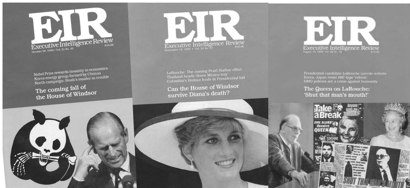
EIR's covers chronicle our ongoing battle with the House of Windsor.

Alegre, have, to the present day, the characteristics of a high-level intelligence operation of a type traceable to the nature of Anglo-French and American activities around the “witting” Paris Review of the 1950s. In this light, the French connections of Goldsmith’s operations targetting Brazil today, coincide with the intention of some to bring down the present government of Brazil. 6