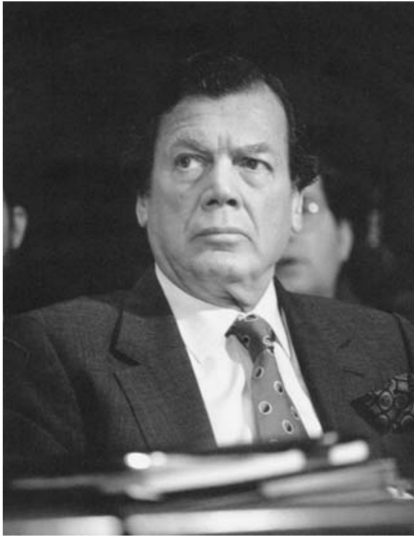
Canada's Edgar Bronfman, the one-time booster of East Germany's Honecker regime, is a point-man for British Commonwealth influence internationally.

cle, authored by notable journalist Wolffsohn, detailed the ongoing role of Bronfman as mediator between East Berlin and Washington, a role dating at least to 1985.