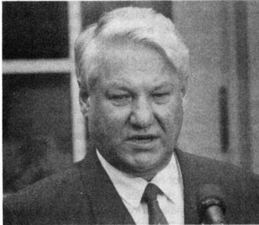
President Boris Yeltsin cracks down on dissent, applies IMF conditionalities.