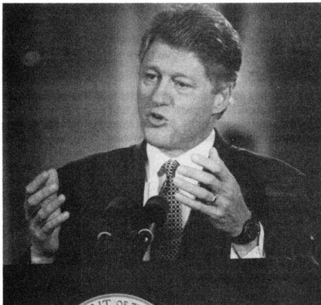
President Clinton: LaRouche advises him to ditch IMF policies immediately.