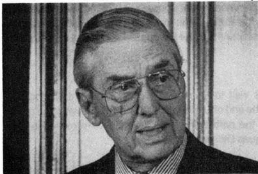
U.S. Treasury Secretary Lloyd Bentsen defends the IMF's line.