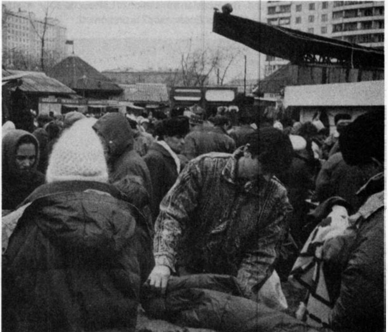
The black market thrives at a Moscow subway station, as real production collapses.

Within two weeks of freeing prices in Russia, consumer goods prices climb four- to fivefold.