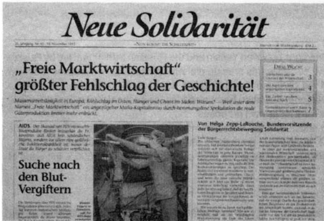
Neue Solidarität proclaims the failure of the free market economy.