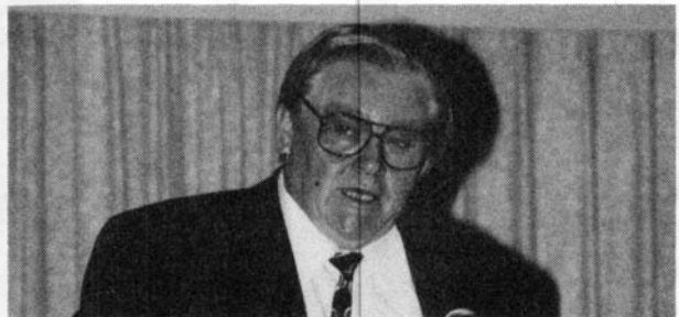
Istvan Csurka, cofounder of the Hungarian Democratic Forum party, and a critic of the IMF.

Istvan Csurka, co-founder of the Hungarian Democratic Forum, raises the first public criticism of the dominant influence of the IMF in the Hungarian economy in the newspaper Magyar Forum . Csurka says that it shows the worst effects.