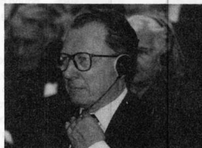
European Commission President Jacques Delors, sponsor of a White Paper for infrastructure development.