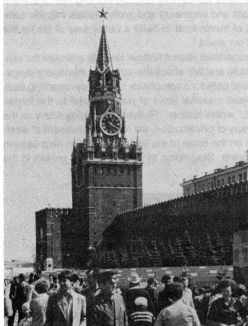
The Kremlin, Red Square: shown here before the fall of communism.