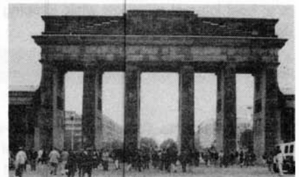
Berlin's Brandenburg Gate after the Berlin Wall came down.

Germany is reunified; Bush and Thatcher decline to attend ceremonies.