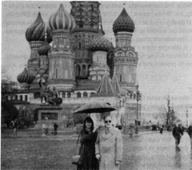
Lyndon and Helga LaRouche in Moscow, April 1994, with St. Basil's Cathedral in the background.

As the lead electoral candidate of the Civil Rights Movement-Solidarity, Helga Zepp-LaRouche speaks before the North German construction fair "Nordbau" on Sept. 14. Her address presents the Eurasian infrastructure program as the way out of the economic crisis. She finds broad agreement among the mid-sized construction contractors.