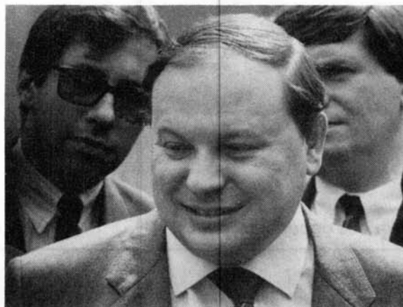
Yegor Gaidar, the IMF's "enforcer" in Russia.

Deputies and representatives of various political parties from Poland, Ukraine, Hungary, Germany, Italy, France, and other countries meet for a working session with LaRouche associates in Kiedrich, Germany, on the theme, "Development Is the New Name for Peace—the Need for a Eurasian Infrastructure-Reconstruction Plan." In a common declaration, they ask "to remove the restraints which the conditionality policy of the IMF imposes on national economies, through the sovereign decisions of the peoples' elected representatives."