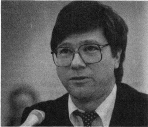
Jeffrey Sachs, Harvard University's "flea market" economist, specialist in destroying nations.