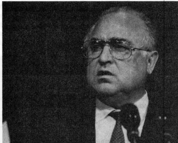
Viktor Chernomyrdin replaces Yegor Gaidar as prime minister; IMF policies continue in modified form.

Ukraine introduces its own currency, the karbovanets. It begins with a parity of 1:1 to the ruble and 1,000:1 to the dollar. After 36 months, it is 80,000:1 to the dollar.